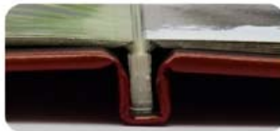
See how flat the pages lie.